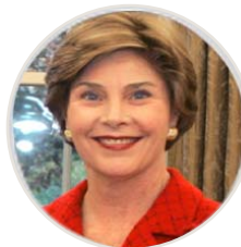
First Lady Laura Bush