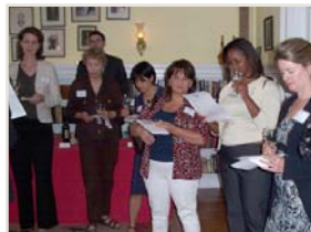
Members and guests savor the wine selections.