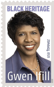
Gwen Ifill stamp

EIJ Recipient Gwen Ifill (2014) has been stamped into history with her new Forever postage stamp, the most recent addition to the Black Heritage series from the US Postal Service. Washington, D.C. Mayor Muriel Bowser declared January 30 Gwen Ifill Day.